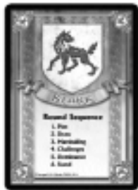
Sample House Card (Stark)

This starter deck contains six different House cards . Each House card has its House name, House shield, and a synopsis of the round sequence printed on it. Other cards affiliated with your House will have the same shield and border color as your House card. (Cards with no shields and a tan-colored border are neutral cards , and belong to no House.)