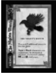
Sample Agenda: The Night's Watch

These cards are permanent modifiers to your House card, giving you access to new specialized powers and appropriate limitations.